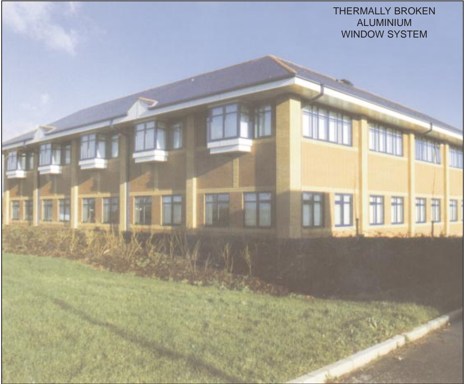
THERMALLY BROKEN ALUMINIUM WINDOW SYSTEM

A wide variety of high performance durable and attractive thermally broken aluminium windows can be created from this comprehensive system.